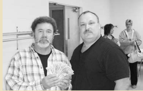
St. Baldrick's before