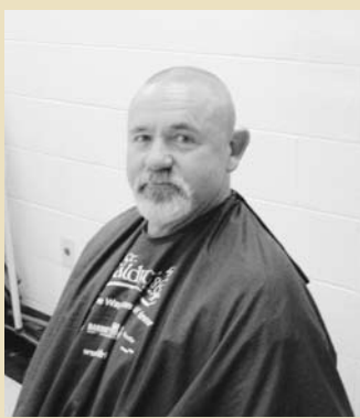
St. Baldrick's after

LABOR DAY PARADE AND PICNIC – SEPTEMBER 6, 2010 APPLICATION APPEARS ON PAGE 5.