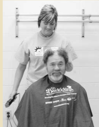
St. Baldrick's during