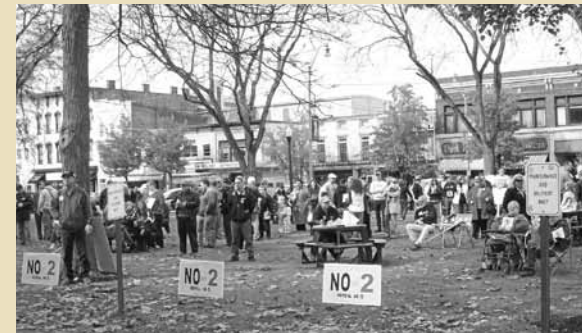
A Rally in Newark, Ohio on the courthouse lawn.

Over the last few years Teamster Members have opened their hearts to help collect coats, mittens, and hats for Walbridge Elementary School. This year Teamster Members were able to help two Elementary schools - Walbridge and Burroughs. The group of students (left) were able to help their classmates at Walbridge Elementary receive toys from Teamsters. The group of students (right) from Burroughs Elementary School were very excited to receive the bags and bags of coats, hats, and mittens to share with their school. Both schools were extremely grateful for all the giving that the Teamster members were able to help with in such time of need.