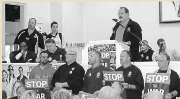
A Rally at The Teamsters Hall with General President Hoffa.