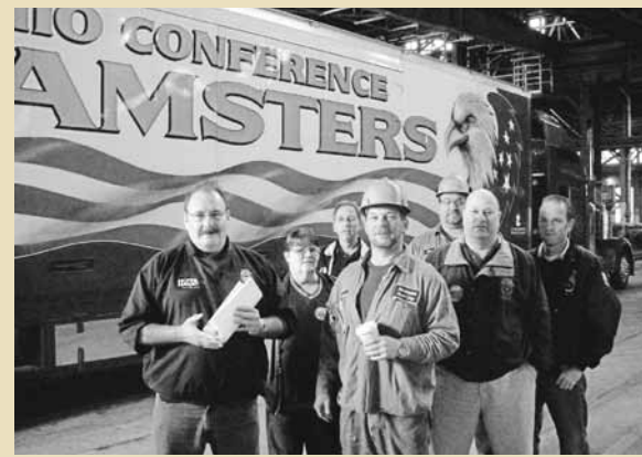
Steel Factory in Youngstown, Ohio.