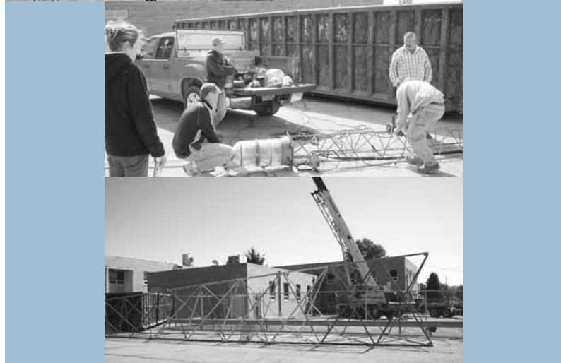
Communication tower being dismantled